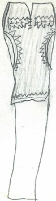
part A- view 2