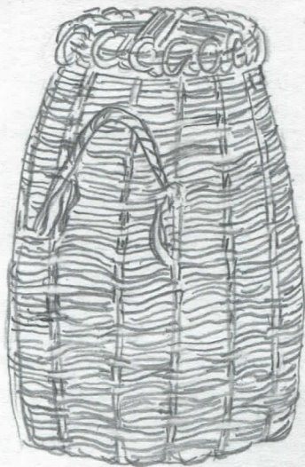
side rim of Lid