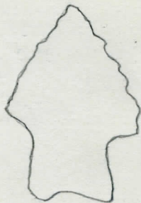
Sub 2 (gray flint)