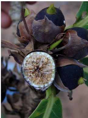
31 Ficus cyclophylla