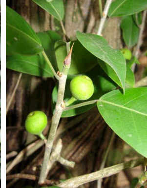
5 Ficus arpazusa