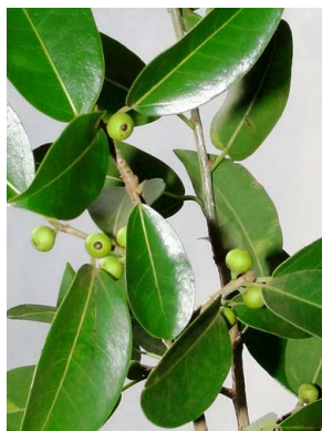
73 Ficus pertusa