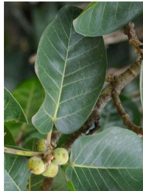
13 Ficus calyptroceras