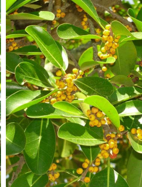
24 Ficus clusiifolia