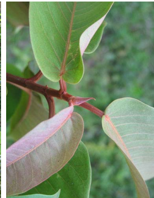
15 Ficus castelviana