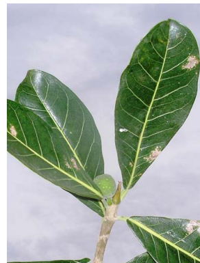
59 Ficus mexiae