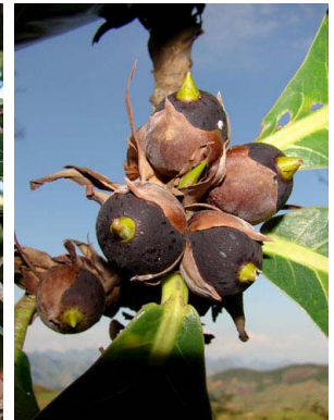
30 Ficus cyclophylla