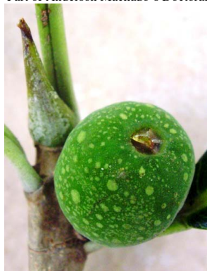
61 Ficus mexiae