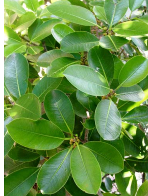
23 Ficus clusiifolia