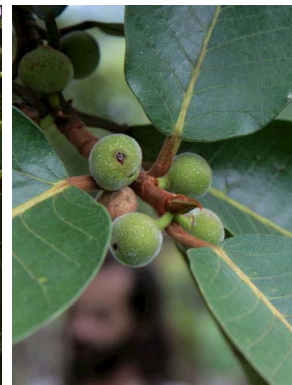
39 Ficus gomelleira