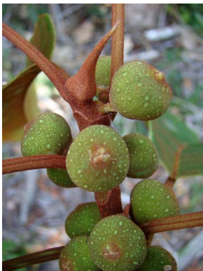
16 Ficus castelviana