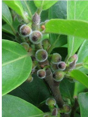
43 Ficus hirsuta