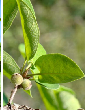
45 Ficus holosericea