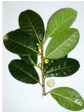
8 Ficus bahiensis