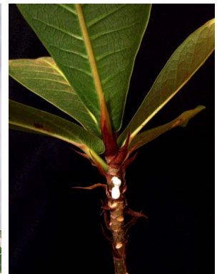
60 Ficus mexiae