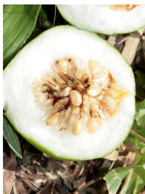
76 Ficus pulchella