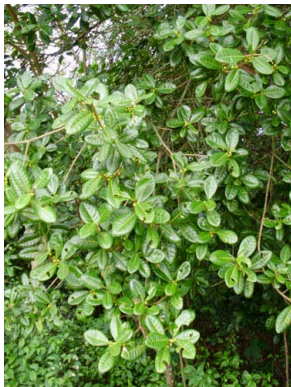
7 Ficus bahiensis