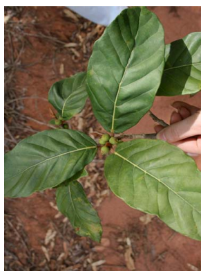
78 Ficus trigona