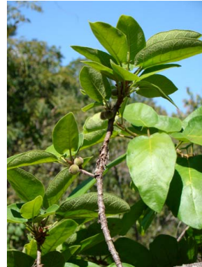
44 Ficus holosericea