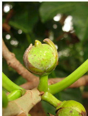
37 Ficus eximia