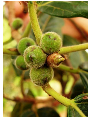
49 Ficus lagoensis