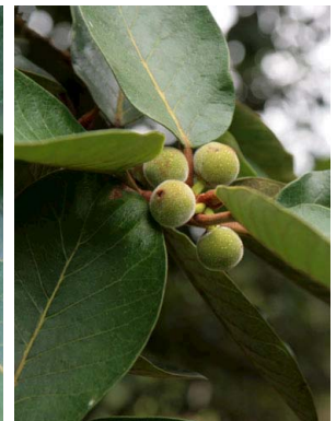
40 Ficus gomelleira