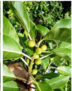
55 Ficus luschnathiana