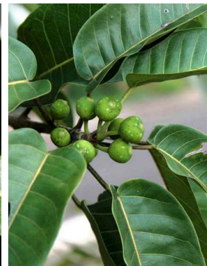
20 Ficus citrifolia