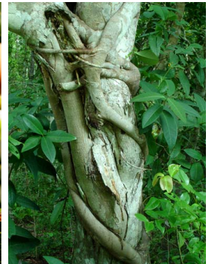
50 Ficus laureola