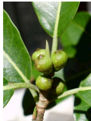
19 Ficus cestrifolia