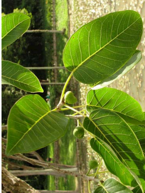
21 Ficus citrifolia