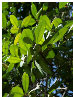
74 Ficus pulchella