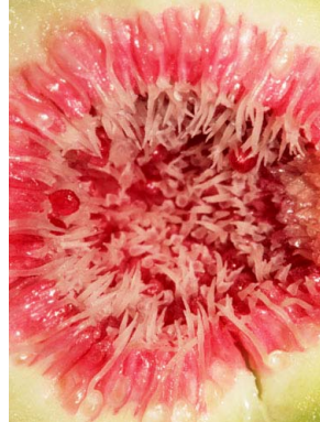
3 Ficus adhatodifolia