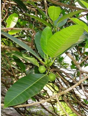
1 Ficus adhatodifolia