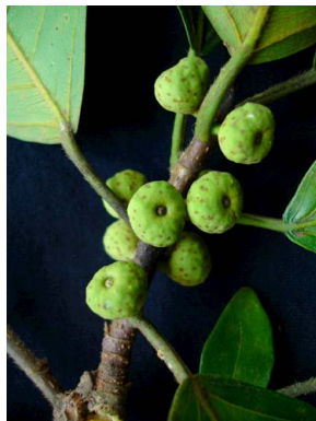
58 Ficus mariae