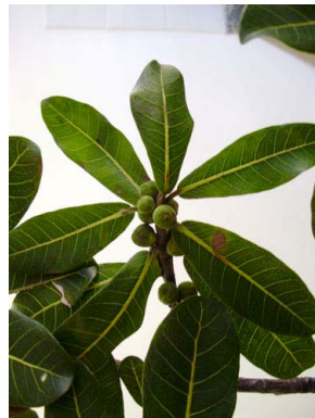
33 Ficus enormis