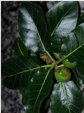
26 Ficus crocata