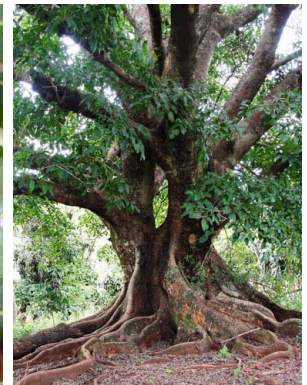
35 Ficus eximia