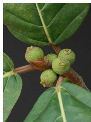
80 Ficus trigona