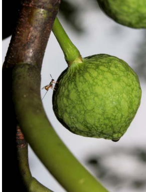
2 Ficus adhatodifolia