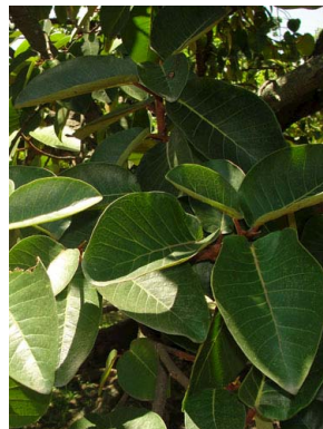
38 Ficus gomelleira