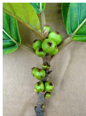
79 Ficus trigona