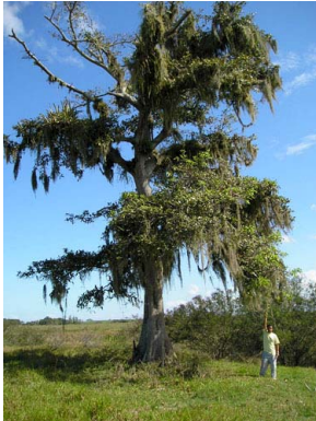
41 Ficus hirsuta