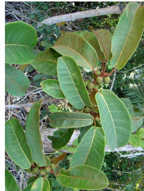
14 Ficus castelviana