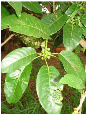
36 Ficus eximia