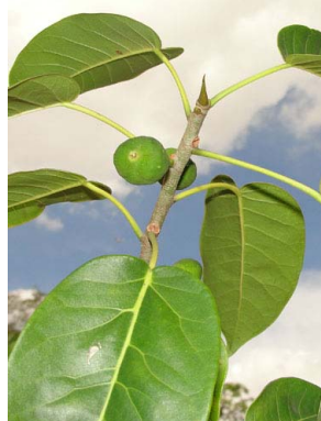
22 Ficus citrifolia