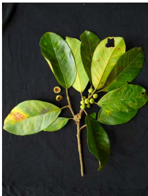
57 Ficus mariae