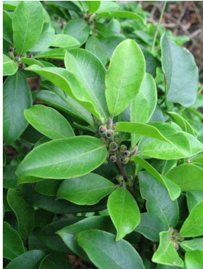
42 Ficus hirsuta