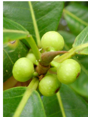
9 Ficus bahiensis