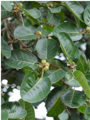
11 Ficus calyptroceras