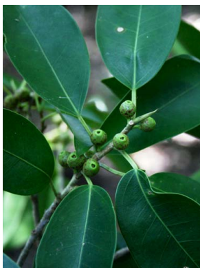
72 Ficus pertusa