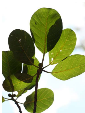
66 Ficus obtusifolia