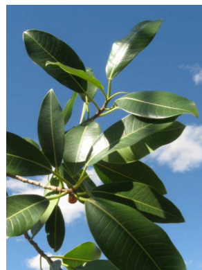
69 Ficus obtusiuscula