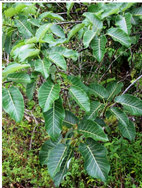
62 Ficus nymphaeifolia