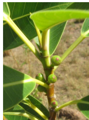
70 Ficus obtusiuscula