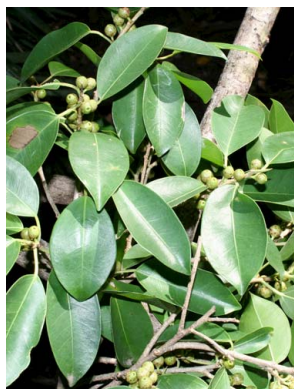
71 Ficus pertusa