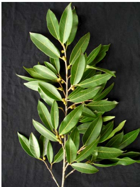
51 Ficus laureola