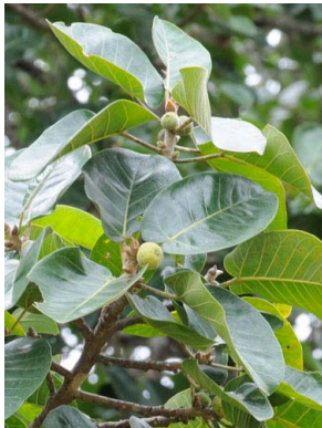
12 Ficus calyptroceras