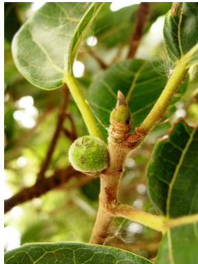
48 Ficus lagoensis