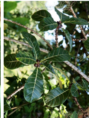
29 Ficus cyclophylla