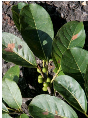
53 Ficus luschnathiana