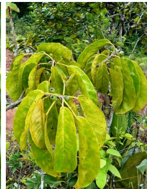
10 Ficus broadwayi