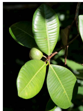
75 Ficus pulchella