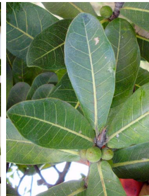
34 Ficus enormis