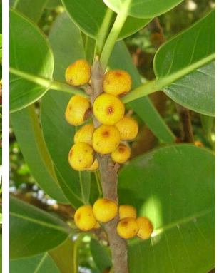
25 Ficus clusiifolia