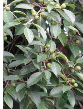
4 Ficus arpazusa