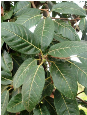
47 Ficus lagoensis