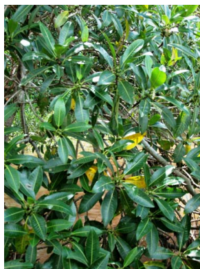
68 Ficus obtusiuscula