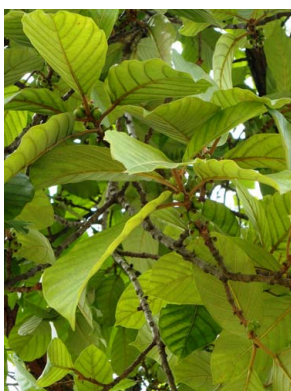
77 Ficus trigona