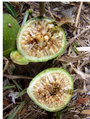
64 Ficus nymphaeifolia