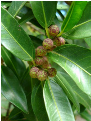
52 Ficus laureola