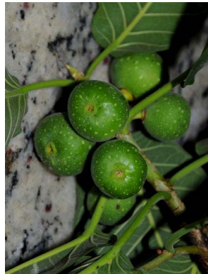
27 Ficus crocata