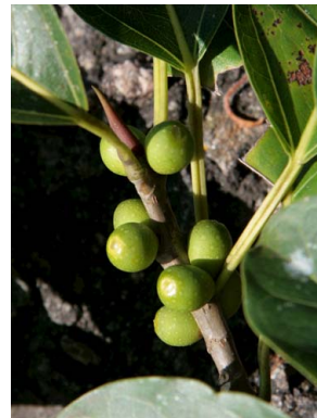
54 Ficus luschnathiana