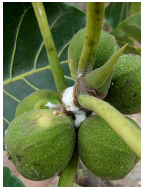
63 Ficus nymphaeifolia