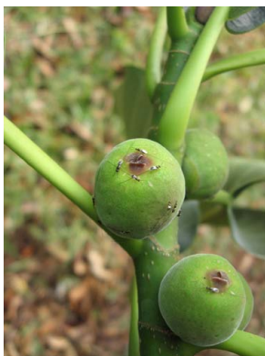
67 Ficus obtusifolia