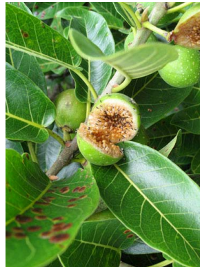
28 Ficus crocata