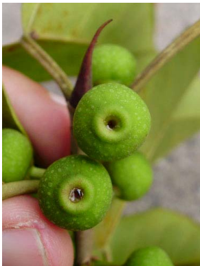
6 Ficus arpazusa