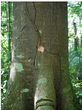
56 Ficus mariae