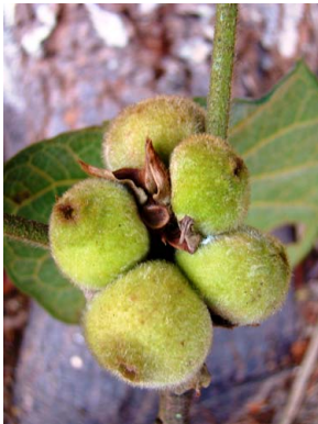
46 Ficus holosericea