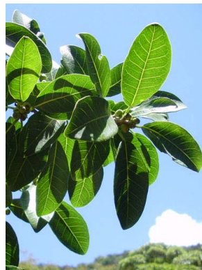
18 Ficus cestrifolia