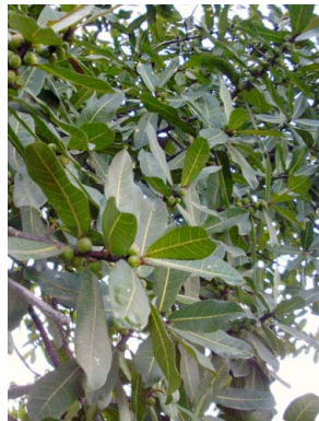
32 Ficus enormis