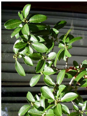
17 Ficus cestrifolia